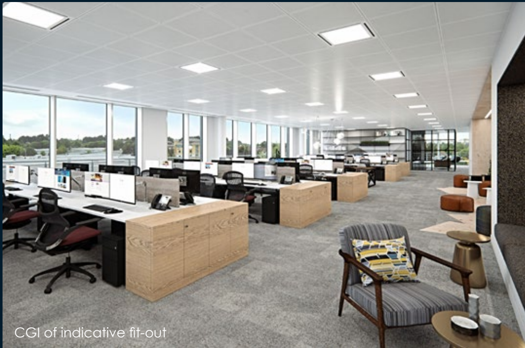
CGI of indicative fit-out