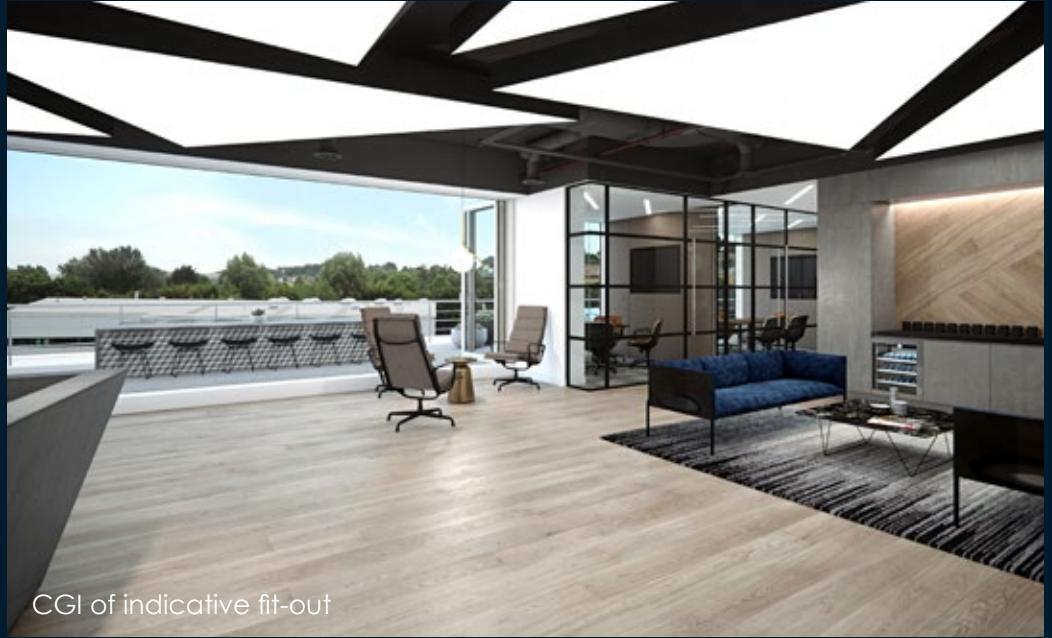
CGI of indicative fit-out